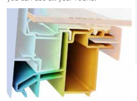
Thermal performance of the polyamide inner section, keeping the heat in and the cold out.

Beyond its visual appeal, the Korniche Flat Glass™ design stands out with its exceptional thermal efficiency, credited to the polyamide inner section. Save money on your energy bills and create a space that you can use all year round.