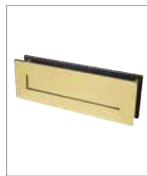
PPB PVD Polished Brass