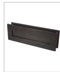
PBK PVD Satin Black