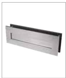
SSS Satin Stainless Steel