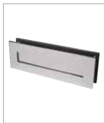
PSS Polished Stainless Steel