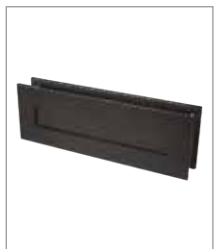
TMB Textured Matt Black