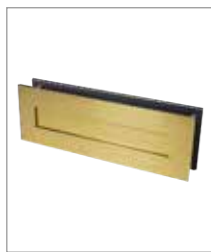
PSB PVD Satin Brass