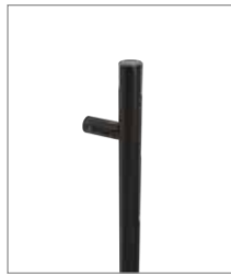
PBK PVD Satin Black