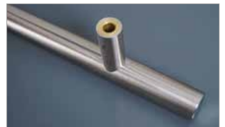
Brass bush fixing ferrules to prevent handles from coming loose