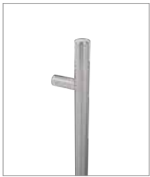
SSS Satin Stainless Steel